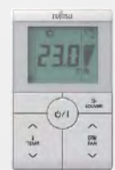
LCD Simple Controller without Operation mode* UTY-RHRYT